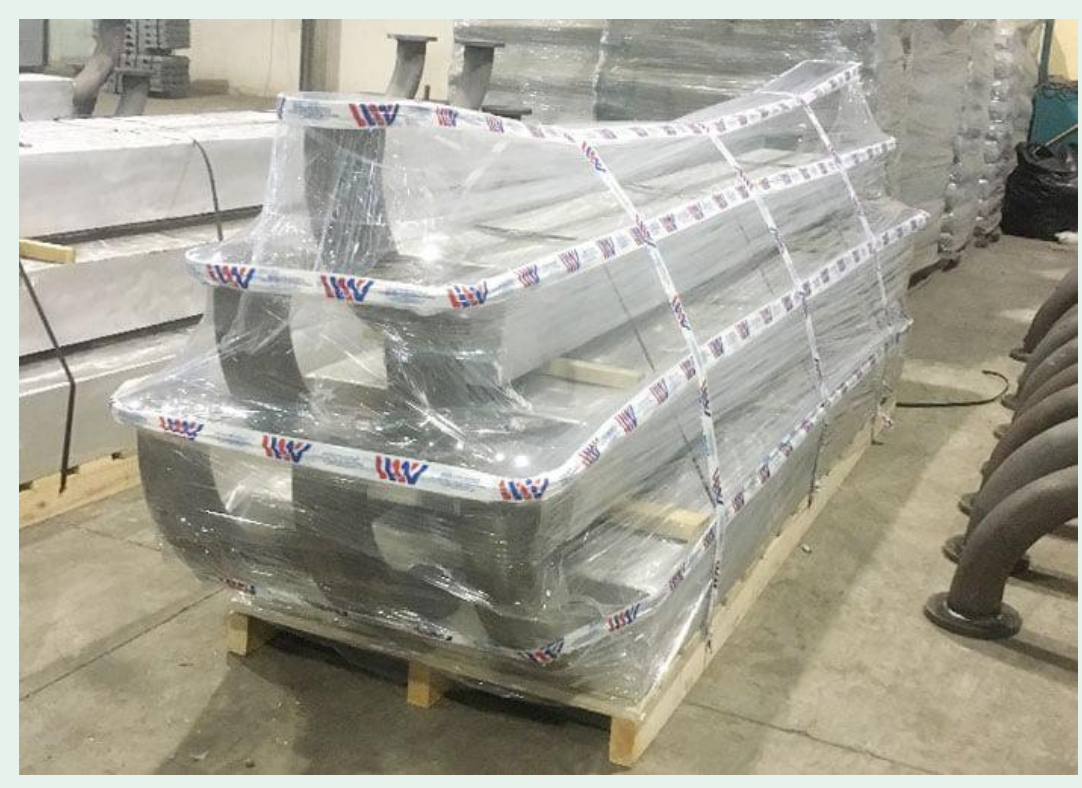
Pallets were replaced...