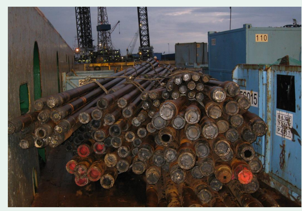
Slings are replaced...