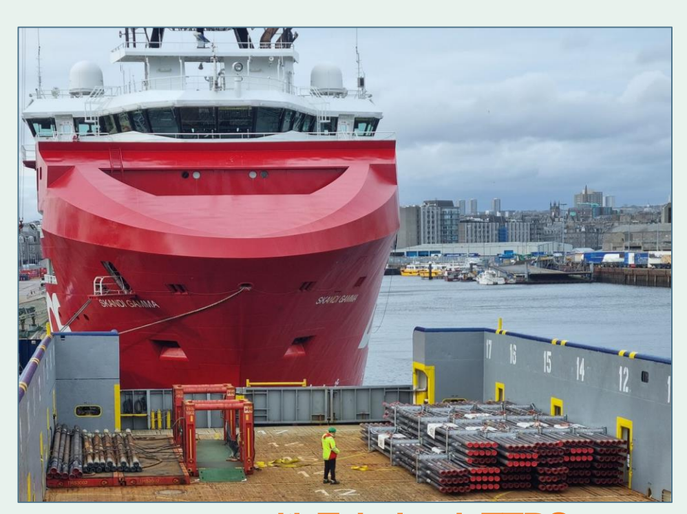
...with TubeLock TTRS.